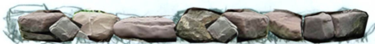
Front Elevation Rocks