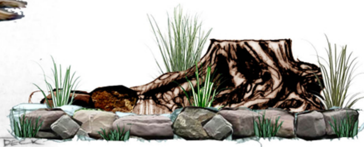
Plastic Grass. Discuss placement with Trainers